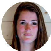
Rebecca Day SDI PRODUCTIONS (UK)